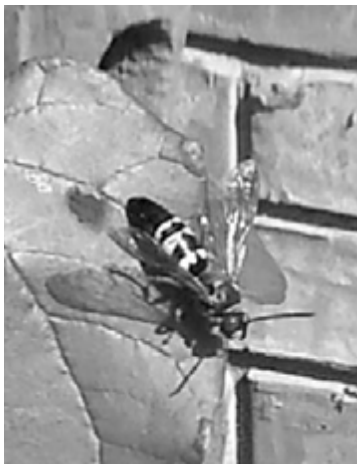
Cicada killer wasp on redbud.