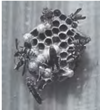
Paper wasps on paper nest.

Asian giant hornets are capable of inflicting a painful sting. Please note that while the sting can lead to death in some cases, it is not what typically happens. People are also capable of receiving painful stings from insects already here in Texas such as honey bees, paper wasps, yellowjackets, or even fire ants and some can die from being stung. Death by insect sting usually depends upon the number of stings and how your body chemistry reacts to venom injected by the insect. Asian giant hornets are capable of killing other insects, including honey bees and other pollinators, but they are not doing this to be vicious or killing for sport. The hornets use insects they kill as food for their larvae....just like