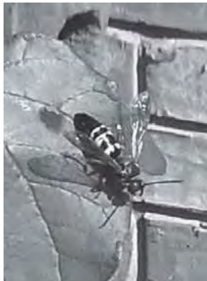
Cicada killer wasp on redbud.