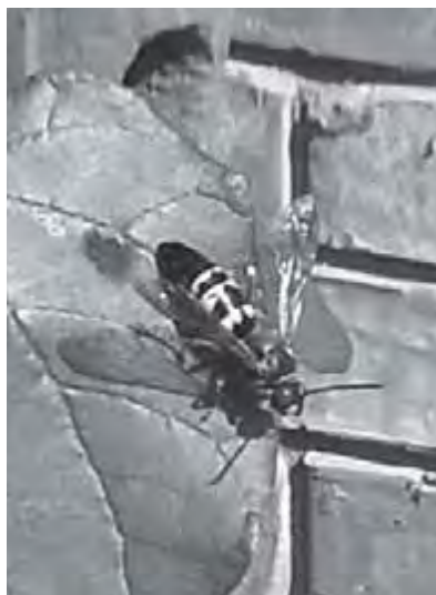
Cicada killer wasp on redbud.