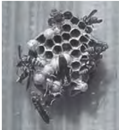
Paper wasps on paper nest.

This work is supported by Crops Protection and Pest Management Competitive Grants Program [grant no. 2017-70006-27188 /project accession no. 1013905] from the USDA National Institute of Food and Agriculture.