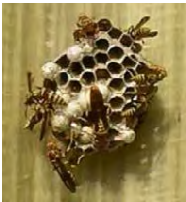
Paper wasps on paper nest.

This work is supported by Crops Protection and Pest Management Competitive Grants Program [grant no. 2017-70006-27188 /project accession no. 1013905] from the USDA National Institute of Food and Agriculture.