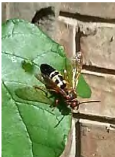
Cicada killer wasp on redbud.