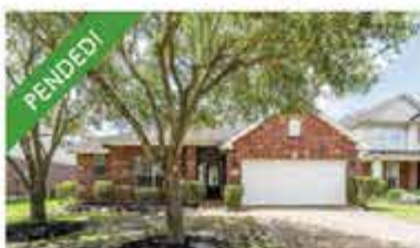
20907 Ochre Willow Trl. $239,000 | 3 / 2 full / 2 Pending in 5 DAYS!