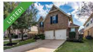
20719 N. Blue Hyacinth $308,000 | 4 / 3 full, 1 half / 2.5 Fabulous Covered Patio!