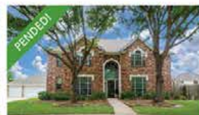
20307 Gentle Mist Court $359,900 | 4 / 3 full, 1 half / 3 Pending!