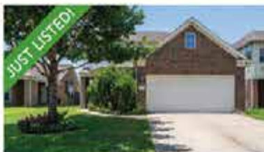
19526 Hardwood Ridge Trl. $225,000 | 4 / 3 full / 2 Bedroom with Full bath down!