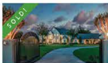
17010 Saddle Ridge Pass $1,799,000 | 5 / 5 full, 5 half / 3 Pending in 3 DAYS!