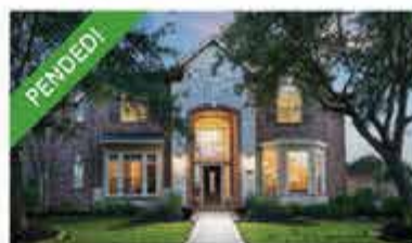
21707 China Green $515,000 | 5 / 3 full, 1 half / 3 Pending in 9 Days!