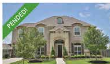
21102 W. Kelsey Creek Trl. $550,000 | 4 / 3 full, 1 half / 3 Pending in 3 DAYS!