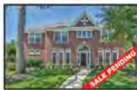
20903 Magnolia Brook 5/3.1/2, 3913 SqFt, $349,900