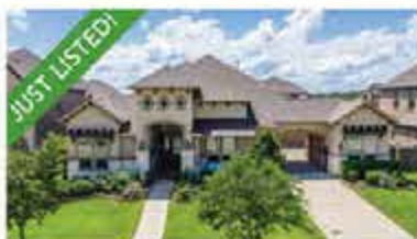
16915 E Caramel Apple Trl. $599,000 | 5 / 5 full, 1 half / 3 Amazing 1.5 Story Home!