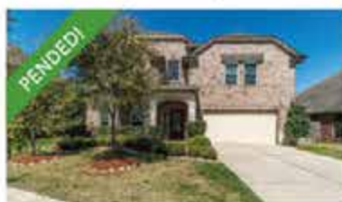
14607 Yellow Begonia Dr. $305,000 | 4 / 3 full, 1 half / 2 Pending!