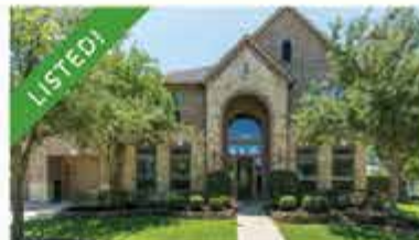
21115 Lexxe Creek Court $589,900 | 4 / 3 full, 1 half / 3 Pool/Spa, 100 Foot Estate Section!