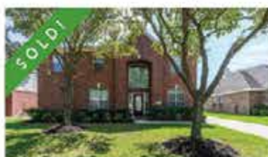
15110 Blue Thistle Drive $295,000 | 4 / 3 full, 1 half / 2 Pending in 4 DAYS!