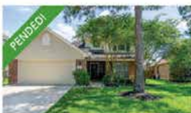
20427 Fairfield Park Way $245,000 | 4 / 2 full, 1 half / 2 Pending in 2 Days!