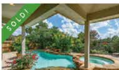
16102 Cumberland Trail $314,900 | 4 / 3 full, 1 half / 2 Pending in 0 DAYS!