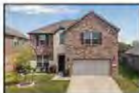
15730 Summer Maple Trail 4/2.1/2, 2702 SqFt, $289,000