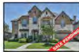
9906 Luna Springs 5/3.1/3, 4417 SqFt, $598,000