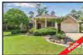
13902 Sandalin Court, 3/2/2, 1910 SqFt, $295,000