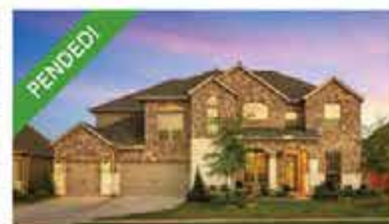
16630 Harbor Falls Drive $625,000 | 5 / 4 full, 1 half / 3 Pending in 1 MONTH!