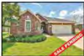
20227 Chad Arbor, 4/2/2, 2263 SqFt, $249,500