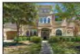
16714 S Swirling Cloud Court 4/3.5/3, 4320 SqFt, $450,000