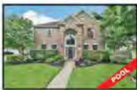
15911 Township Glen, 4/3.1/3, 2959 SqFt, $370,000