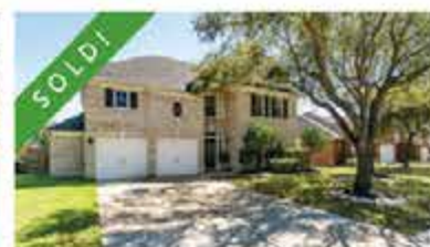
15314 Fairfield Falls Way $310,000 | 4 / 3 full / 2 SOLD!

©2019 Better Homes and Gardens Real Estate LLC. Better Homes and Gardens is a registered trademark of Meredith Corporation licensed to Better Homes and Gardens Real Estate LLC. Equal Opportunity Company. Equal Housing Opportunity. Each Franchise is Independently Owned and Operated.