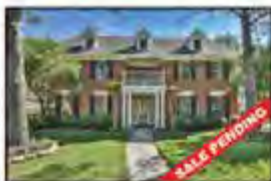
15602 Wildwood Run 4/3.1/2, 3261 SqFt, $329,000