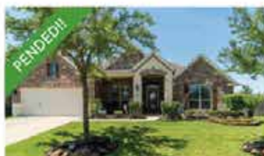
14802 S Canary Yellow Cir. $334,900 | 4 / 3 full / 3 Pending in 1 Day!