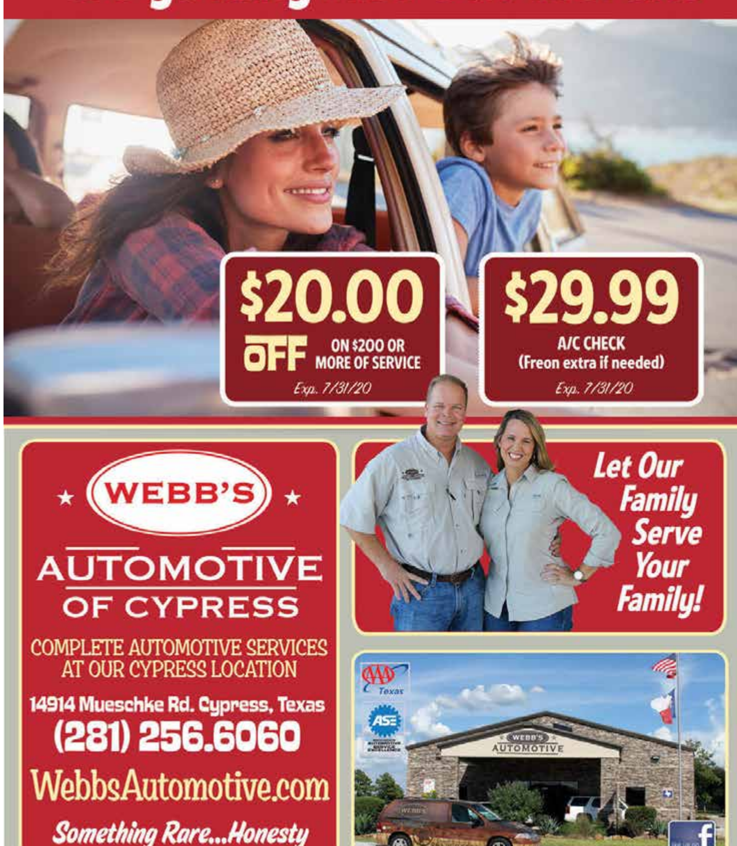
Lakes of Fairhaven - July 2020 5