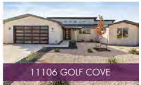
11106 GOLF COVE

- $125,500 - .278 Acre Lot - Lot located 20 feet above floodplain - Level lot in private cul-de-sac is ready for building - Lot backs to the 7th hole