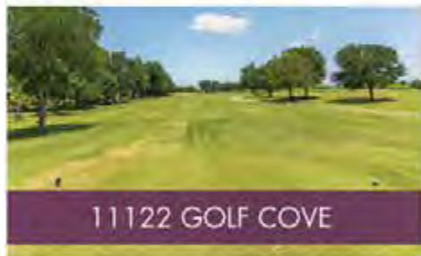
11122 GOLF COVE

HERE'S YOUR CHANCE TO OWN OR BUILD A CUSTOM HOME ON THE SEVENTH HOLE OF AUSTIN'S MOST HISTORIC GOLF COURSE!