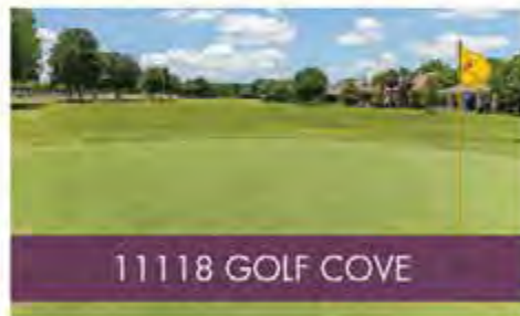
11118 GOLF COVE