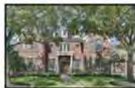
20418 Lakeland Falls Dr 5/3.1/2, 4320 SqFt, $449,900