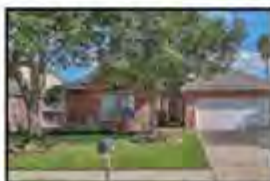
15318 Bent Twig Way 4/2/2, 2161 SqFt, $260,000