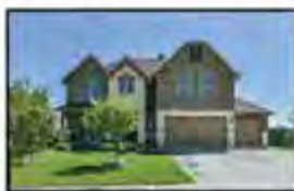
16710 Orchid Mist Drive 4/3.1/3, 3797 SqFt, $415,000