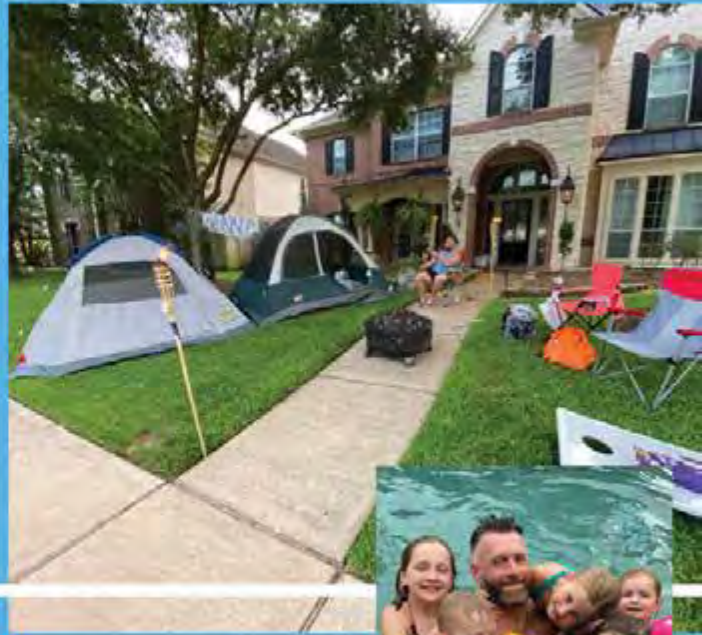
by Rae Cohen

Our adventure will definitely go into the memory books and be something that we look back on as the wonderful "staycation" of the summer of 2020.