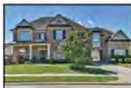
20819 Twisted Leaf Drive 5/3.1/3, 3968 SqFt, $429,000