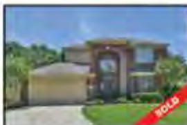
20311 Elmwood Brook Court 4/2.1/2, 2352 SqFt, $262,500