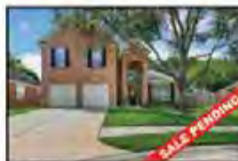
20306 Bent Aspen Court 4/2.1/2, 2524 SqFt, $270,000