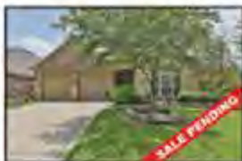
14902 Orange Bloom Ct 4/2/2, 2567 SqFt, $285,000