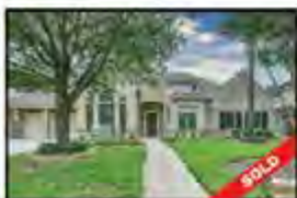
16318 Rolling View Trail 4/2.1/3, 3110 SqFt, $349,900