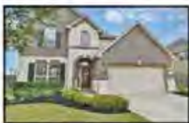
14603 W Apricot Blush Court 4/2.1/2, 2844 Sqft, $305,000