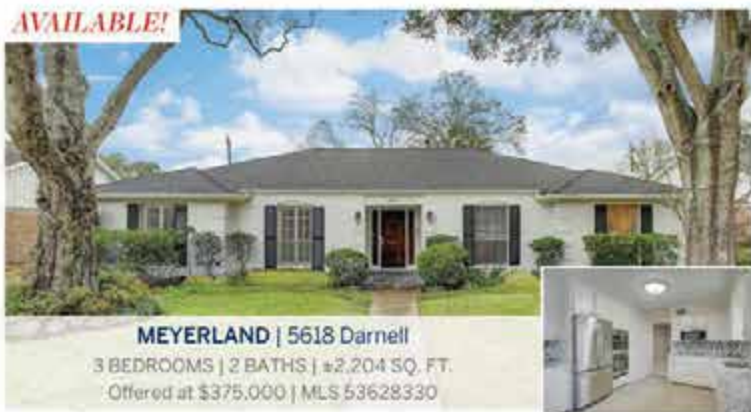
MEYERLAND | 5618 Darnell 3 BEDROOMS | 2 BATHS | ±2,204 SQ. FT. Offered at $375,000 | MLS 53628330