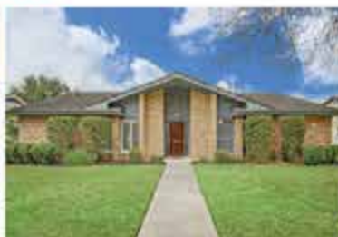
MEYERLAND | 5751 Birdwood 4 BEDROOMS | 2.5 BATHS | ±2,986 SQ. FT. Last list price $498,000