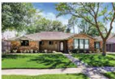
MEYERLAND | 5223 Jackwood Street 3 BEDROOMS | 2 BATHS | ±1,943 SQ. FT. Last list price $400,000