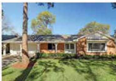
MEYERLAND | 5222 Carew Street 3 BEDROOMS | 2 BATHS | ±1,762 SQ. FT. List price $419,500