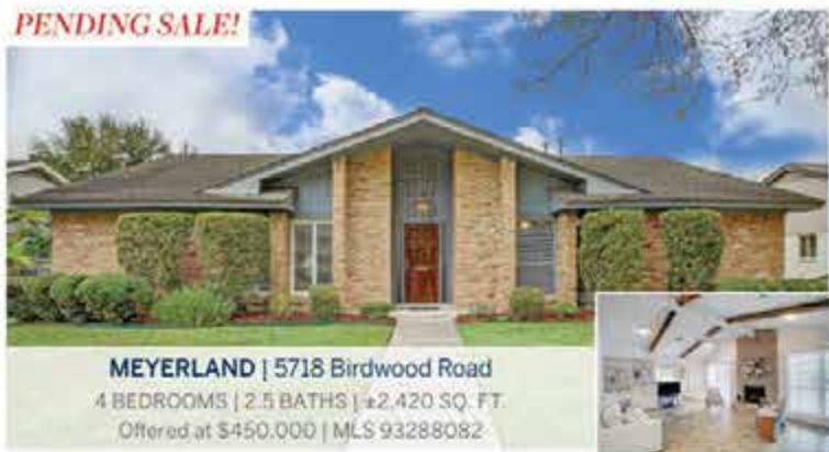
MEYERLAND | 5718 Birdwood Road 4 BEDROOMS | 2.5 BATHS | ±2,420 SQ. FT. Offered at $450,000 | MLS 93288082