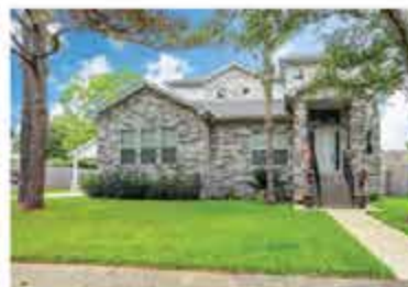
MEYERLAND | 4978 Valkeith Drive 4 BEDROOMS | 3 BATHS | ±2,750 SQ. FT. Last list price $698,500

Contact us with all your real estate needs.