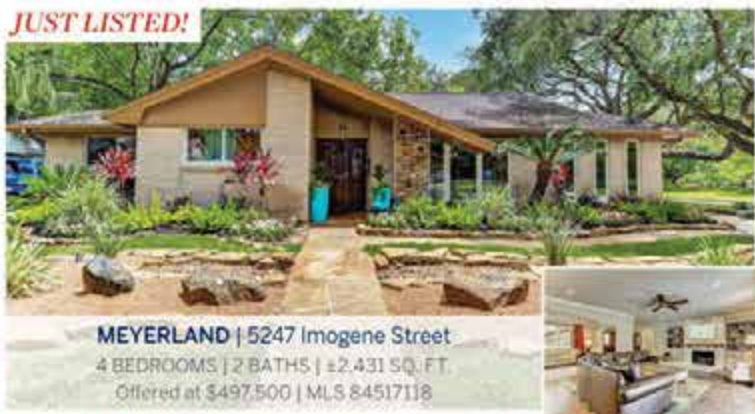
MEYERLAND | 5247 Imogene Street 4 BEDROOMS | 2 BATHS | ±2,431 SQ. FT. Offered at $497,500 | MLS 84517118