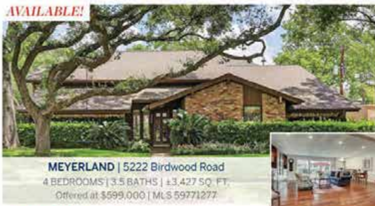
MEYERLAND | 5222 Birdwood Road 4 BEDROOMS | 3.5 BATHS | ±3,427 SQ. FT. Offered at $599,000 | MLS 59771277