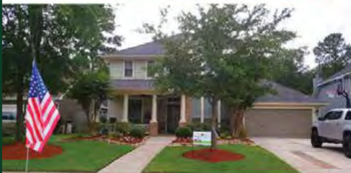
28331 Ryans Ridge-Mulberry Park

Three yards will be selected each month, May through August. Winners will receive a gift card and their yards highlighted on the Spring Trails website and newsletter. Good luck and happy landscaping!