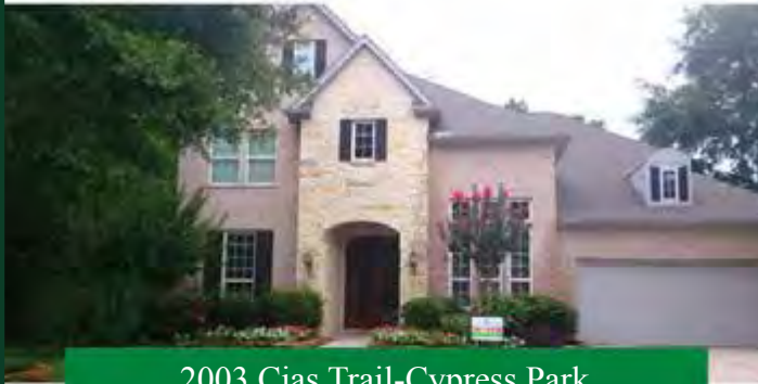
2003 Cias Trail-Cypress Park

Congratulations to Spring Trails' June 2020, Yard of the Month winners! Well done!