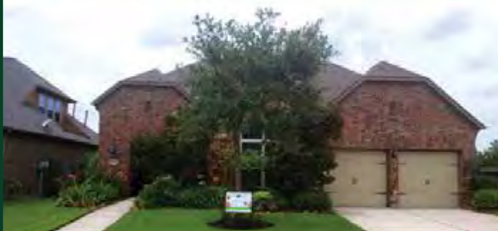
23706 Turner Slate-Hawthorn Trails