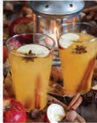
Gingered Hot Cider