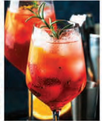
Blackberry & Sage Spritzer