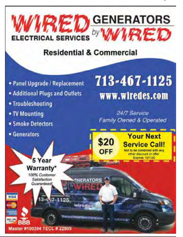
The Bridgeland Times - September 2020 3