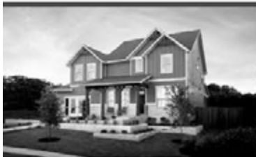
NEW! ASHTON WOODS