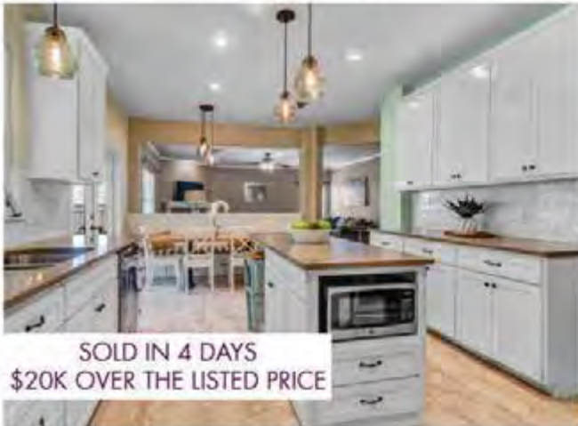
SOLD IN 4 DAYS $20K OVER THE LISTED PRICE

As an expert in the Austin market and Southwest Austin's #1 agent, it is my top priority to make sure we exceed your expectations.