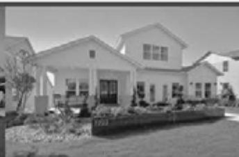
DREAM FINDERS HOMES