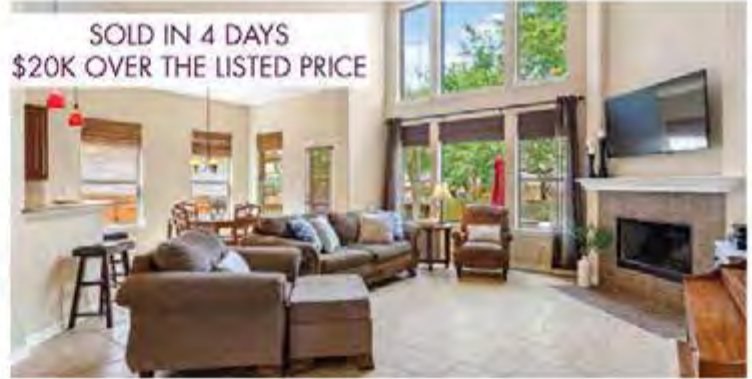
SOLD IN 4 DAYS $20K OVER THE LISTED PRICE