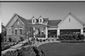
DAVID WEEKLEY HOMES