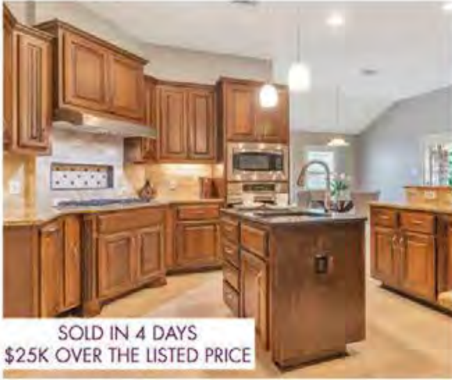
SOLD IN 4 DAYS $25K OVER THE LISTED PRICE