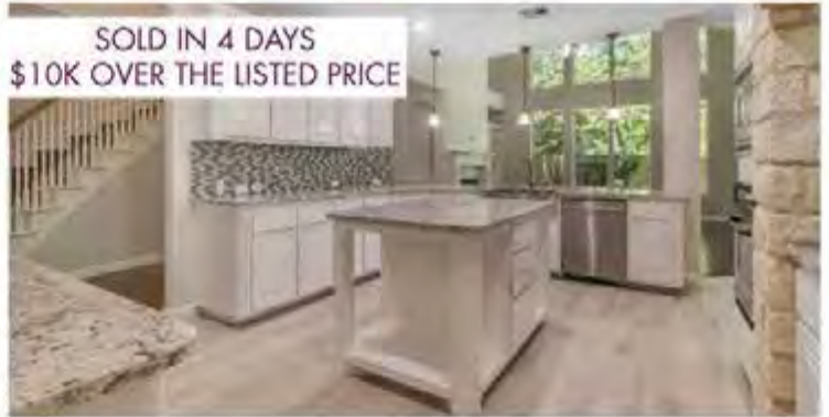
SOLD IN 4 DAYS $10K OVER THE LISTED PRICE