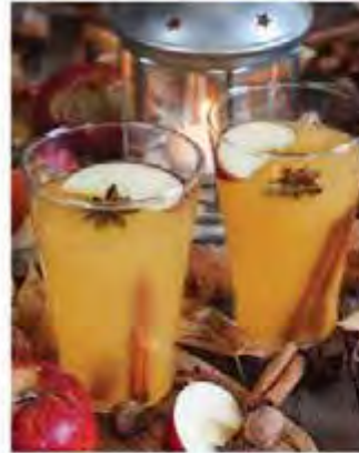
Gingered Hot Cider