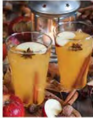
Gingered Hot Cider