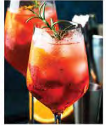
Blackberry & Sage Spritzer