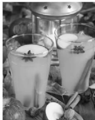
Gingered Hot Cider