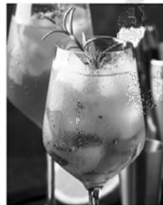
Blackberry & Sage Spritzer