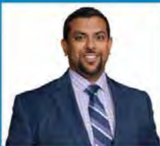
Second Generation Willowbridge Resident

Thinking of Buying or Selling? Contact Me Today!