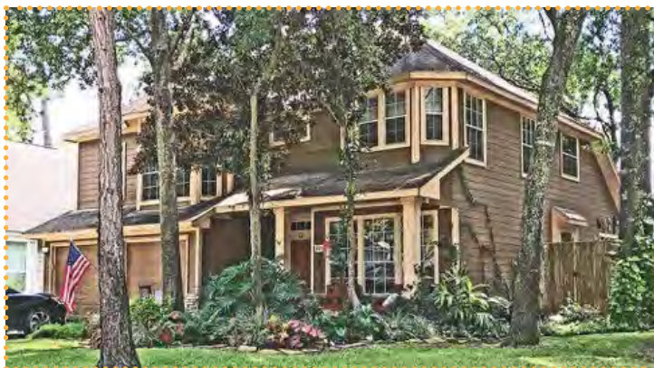
9315 Rhythm Lane