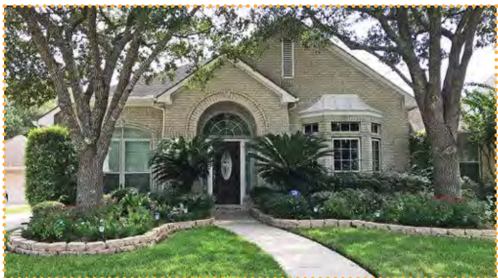
8619 Concerto Circle