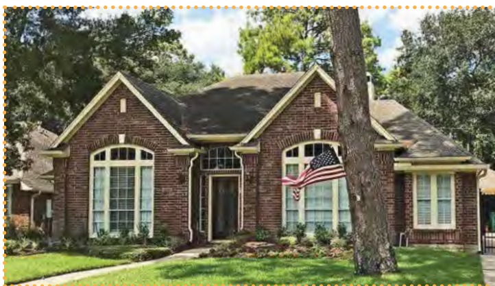
8910 Andante Drive