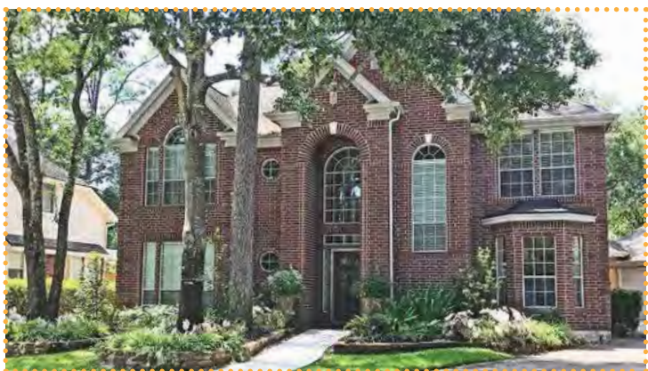
9011 Ensemble Court