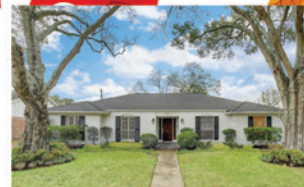
5618 DARNELL 3 BED | 2 BATH List price $375,000