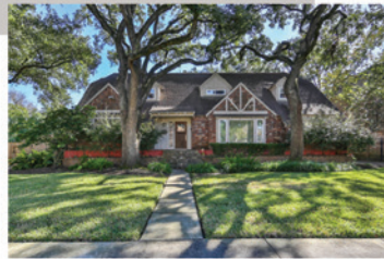
5 Bedrooms/2.5 Baths $525,000