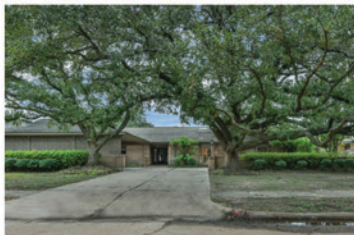
SOLD Braesheather Lot