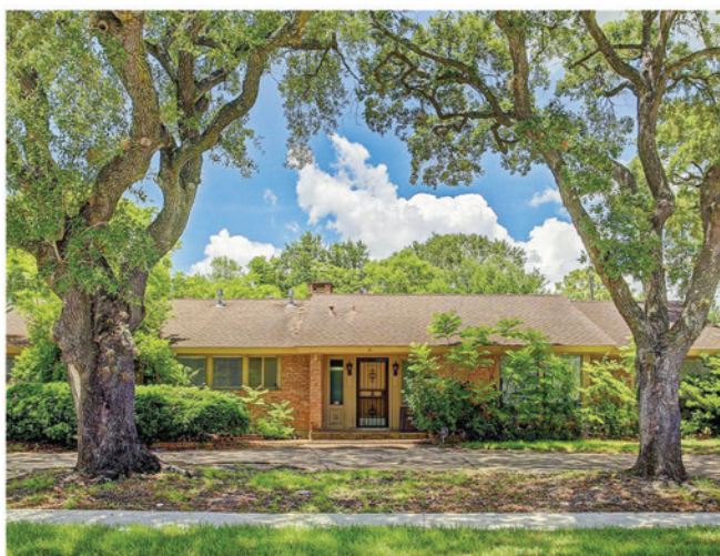
5002 N BRAESWOOD | 4 BED | 3.5 BATH | Offered at $299,000