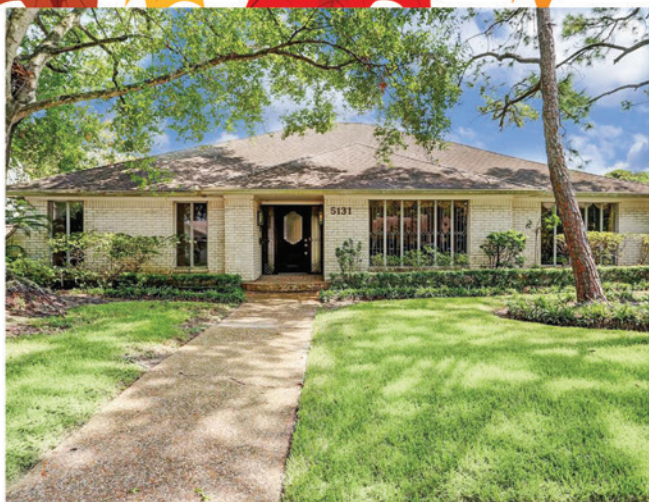
5131 QUEENSLOCH | 4 BED | 3.5+ BATH | Offered at $350,000