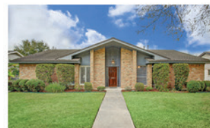
5718 BIRDWOOD 4 BED | 2.5 BATH List price $450,000

Contact us with all your real estate needs.