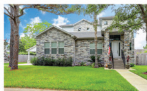
4978 VALKEITH 4 BED | 3 BATH List price $698,500