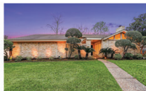
5751 BIRDWOOD 4 BED | 2.5 BATH List price $498,000