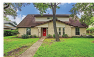
9714 S RICE AVENUE 5 BED | 3.5 BATH List price $299,000