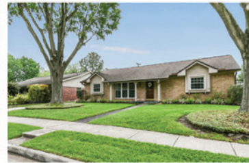
3 Bedrooms/2 Baths $379,000