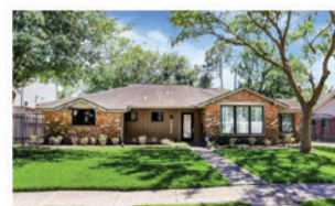
5223 JACKWOOD 3 BED | 2 BATH List price $400,000