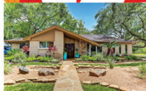
5247 IMOGENE 4 BED | 2 BATH List price $497,500