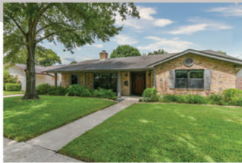
3 Bedrooms/2.5 Baths $423,000