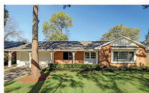
5222 CAREW 3 BED | 2 BATH Last list price $419,500