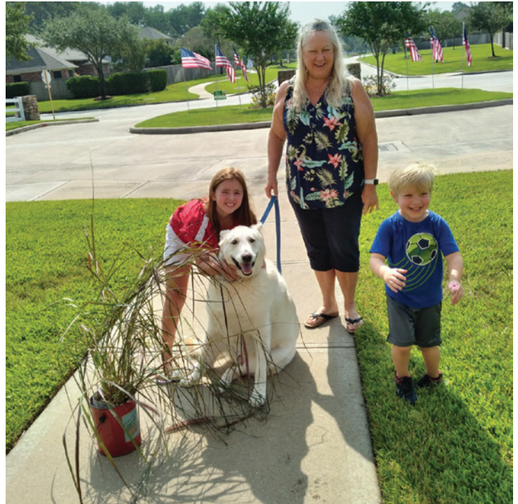
Even the dogs came out for the Garden Swap to the delight of the neighborhood kids.

As always, the Social Committee welcomes you—to join our team or to help at an event. Send us a message at socialcommittee@villagecreek.us .