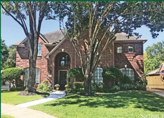
7611 Crescendo Court