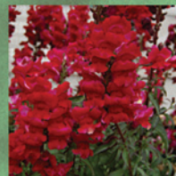
Snapdragon Sonnet Crimson