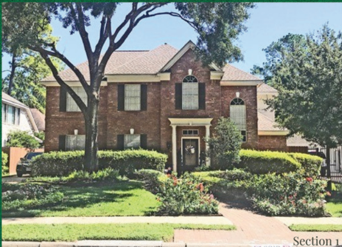
8010 Sonata Court