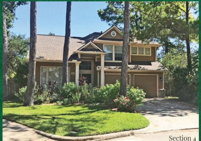
9503 Musical Court