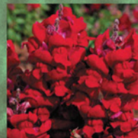
Snapdragon Montego Red