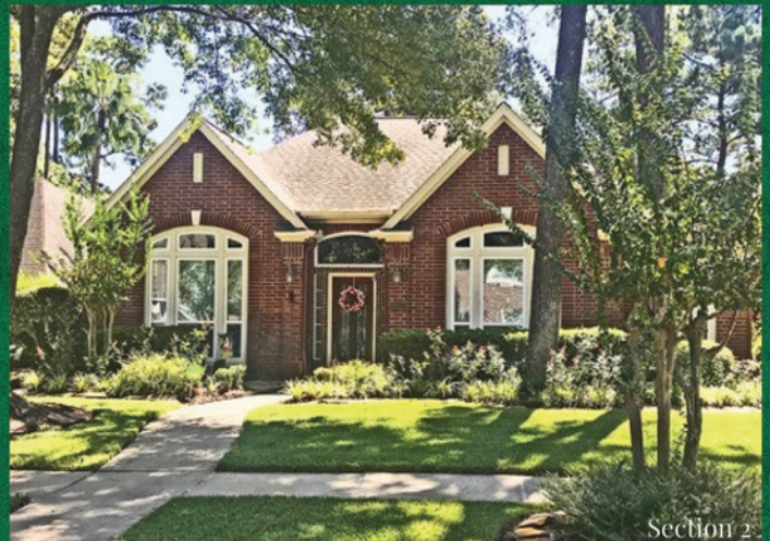
9007 Rhapsody Lane