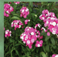
Dianthus Amazon Rose Magic