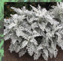
Dusty Miller Silver Dust