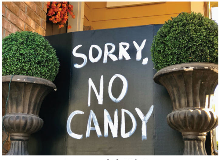
Sorry, no candy!