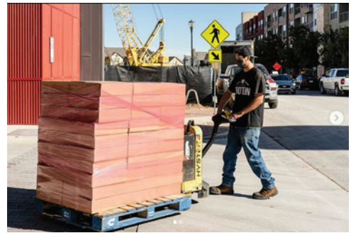
Meals Shipping Colleens

Orman noted, "We want more restaurants involved in solving food insecurity." He stated participating in the program has made him even more aware of the issue and allowed them to take on some of the load that volunteers and food banks typically