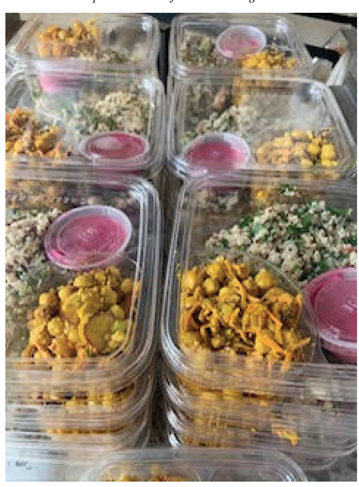
Quinoa tabouli with curried chickpea salad and beet yogurt

Disclosure notice: Colleen's Kitchen and L'Oca d'Oro have made in-kind contributions and sponsored events of the Mueller Neighborhood Association.