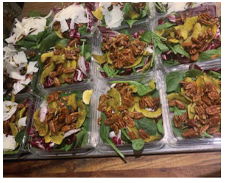
Radicchio and spinach salad with candied pecans and grana padano