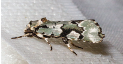
Beloved Emarginea Moth

medieval times branches of mistletoe were hung from the ceiling to ward off evil spirits. With the process of immigration and settlement of North America, traditions associated with the European plant were transferred to the New World and evolved into a folklore all its own.