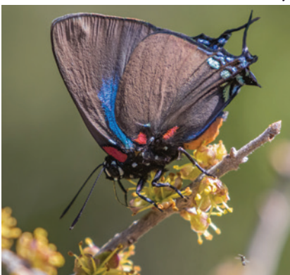
Great Purple Hairstreak

species. It has small, elliptical evergreen leaves and smooth green stems covered by short hairs, with tiny green flowers on the male plant and shiny white berries on the female plant. Widely used in the United States as a Christmas decoration, it is especially common growing on Sugar Hackberry, Cedar Elm, Honey Mesquite and other hardwood trees in Texas as well as Oklahoma, Louisiana, and Mississippi.