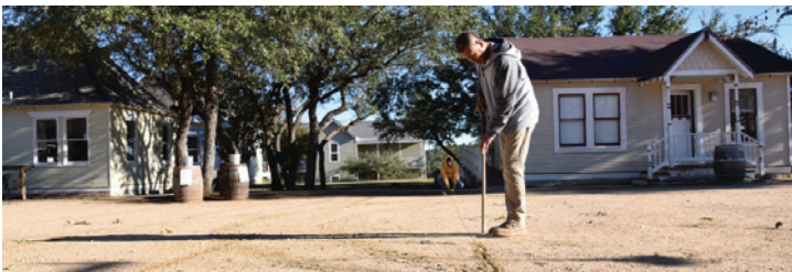
Star Hill Ranch employee draws the space lines for attendees to use when setting up their chairs.