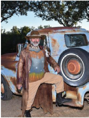
Lake Travis Film Festival Ken Deuble as Tallahassee in Zombieland