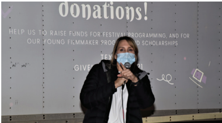
LTFE Membership Chair welcomes guests and explains the benefits of membership.