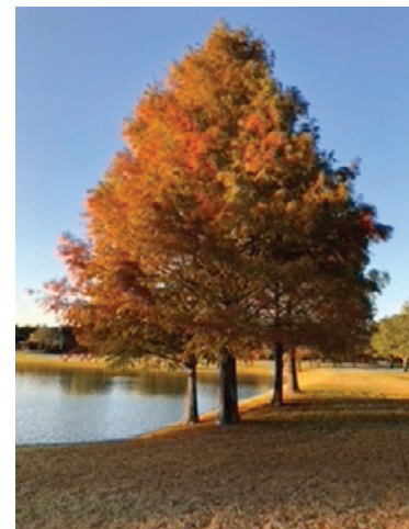
near the foot bridge