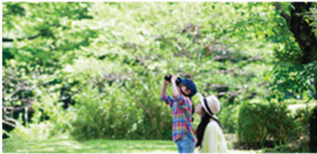
BIRDWATCHING - BEST PLACES NEAR HOUSTON

We would like to share these special opportunities with you!