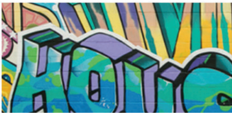
HOUSTON ART TO EXPLORE OUTDOORS

For more information regarding these opportunities please visit: https://www.bethwolff.com/blog/