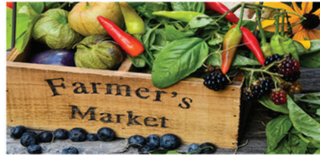
BEST FARMERS MARKETS IN HOUSTON