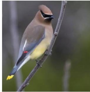
Cedar waxwing.