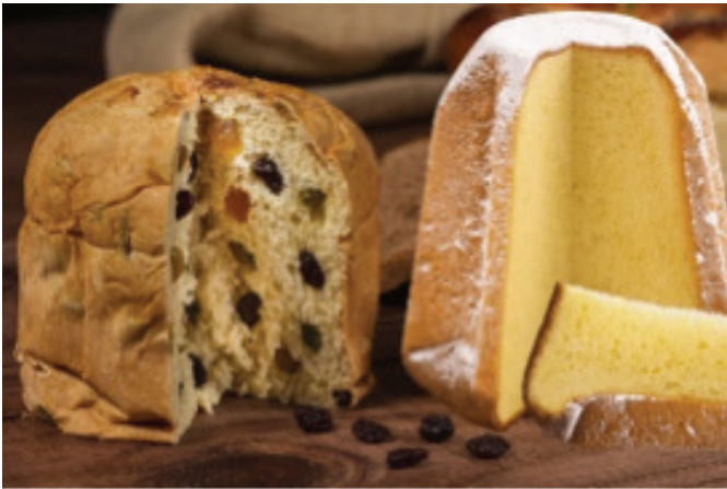
(Panettone and Pandoro)