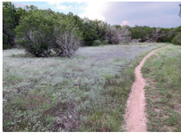
Edge habitat along J-Canyon Trail.

For more information about the Balcones Canyonlands Preserve, please visit https://www.traviscountytexas.gov/tnr/nr/bcp . You can also check us out on Facebook at facebook.com/traviscountybcp and Instagram @bcp_traviscounty.