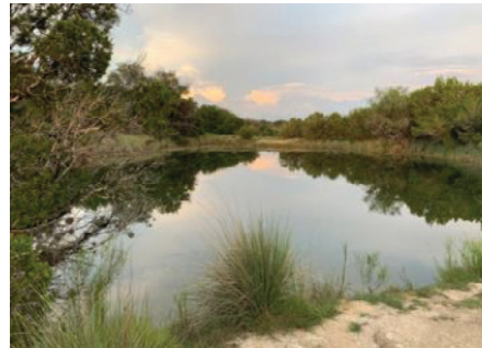
(Pond on J-Canyon Trail.)