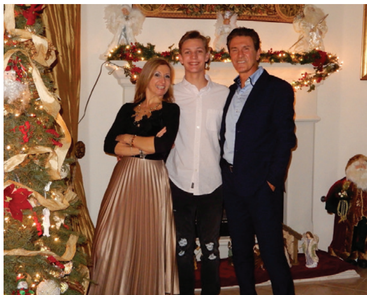
(The Papi celebrating Christmas at home in Austin)

In Italy the most classical Christmas cakes are the Pandoro and the Panettone. Panettone is often compared to fruitcake because it contains raisins and candied fruits. Pandoro, true to its name (pan d'oro means "golden bread") has a bright yellow color and doesn't have raisins or candied fruit. But each Italian region and town has very different food traditions, so there are really hundreds of appetizers, first/second courses, side dishes, desserts, wines and liqueurs. As a traditional recipe from my region, the Apulia, I want to mention the "sanacchiudere". This is one of the most simple and delicious treats typical for the Christmas and Carnival season. These slightly crunchy fried dough balls coated with honey and orange zest are simply irresistible.