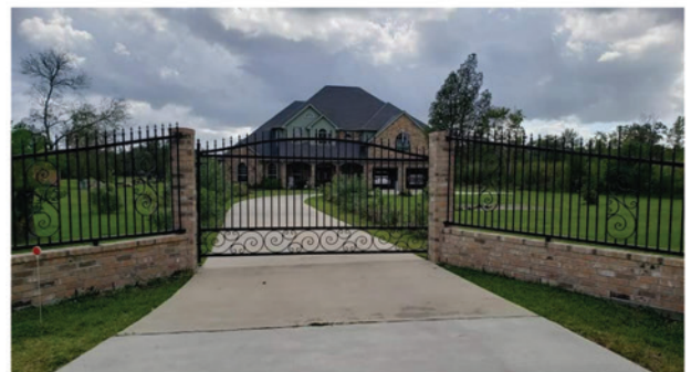
IRON AND BRICK

Phone or text 832.330.9298 We have satisfied customers all over Cypress that will be happy to share their experience working with us.