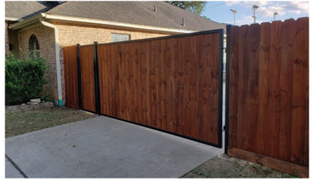
WOOD AND IRON

Specializing in wood fences, iron gates, handrails, burglar bars, custom ornamental, carports, metal swing doors, railing, metal doors. We also install, repair, and replace gate motors.