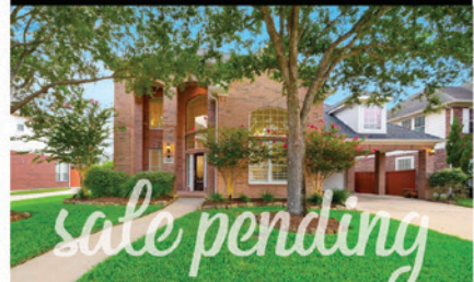
12419 Santiago Cove