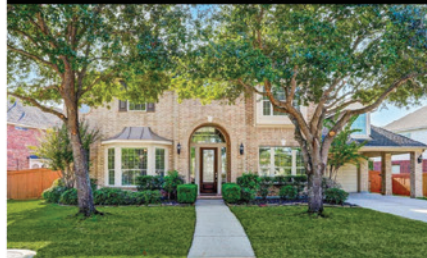
6203 Bollina Canyon