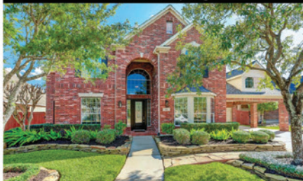
6310 Collina Springs