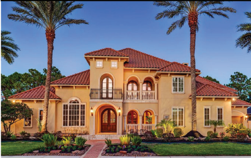
5410 Morning Breeze